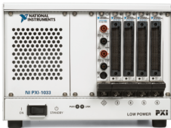
Figure 1. Expand channel count with PXI switching.

You can easily combine the NI PXI-4065 DMM with NI PXI switches in the low-cost NI PXI-1033 integrated chassis and controller to create high-channel-count, 6½-digit data-logging systems with up to 588 channels. You can configure these systems, controllable from any PCI Express or ExpressCard slot on a PC or laptop computer, with more than 100 available PXI switch topologies. For further system expansion, you can add more than 3,000 channels with each additional 18-slot PXI chassis.