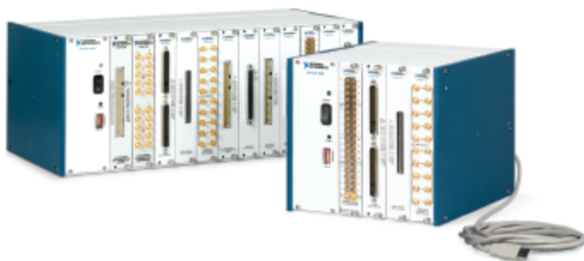
Figure 2. Expand channel count with USB-controlled switching.

You can integrate NI 4065 DMMs with stand-alone switching using the 4- or 12-slot USB Switch Mainframes from National Instruments. You can configure these switch systems, controllable from any available USB port on a PC or laptop computer, with more than 50 available SCXI switch topologies. For existing SCXI switch systems, the NI 4065 DMMs can also provide control via the AUX connector on the front of the DMM. Switching offers a simple method of channel expansion for data-logging systems based on an NI 4065.