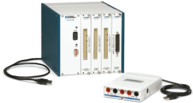
Figure 3. Use the USB-4065 with USB-controlled switching for a complete DMM/switch solution.