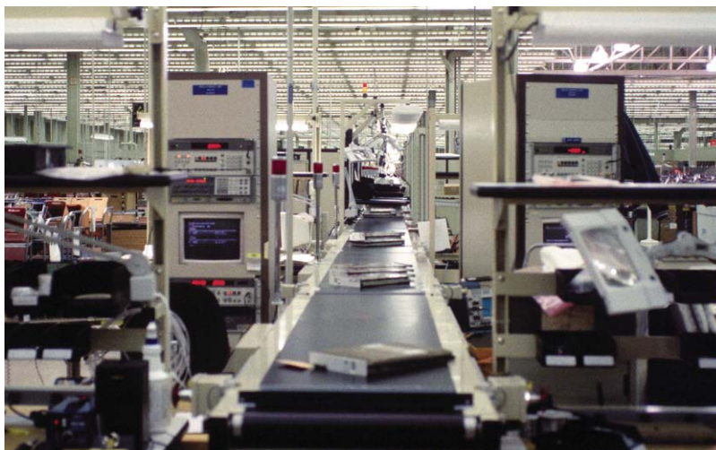
The express MXGs are optimized to provide the accurate and repeatable reference signals needed on an R&D bench or the production line. All of this capability fits into just two rack units (2RU), saving valuable rack space.