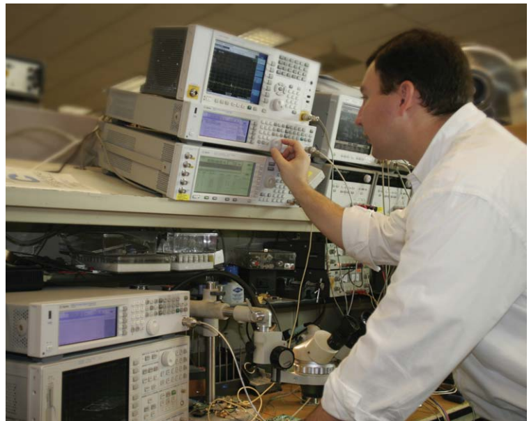
Express MXG analog signal generators cover a wide range of applications including local oscillator (LO) and clock substitution; continuous wave (CW) interferers; power calibration; antenna testing; and analog communication systems that use AM, FM or phase modulation.