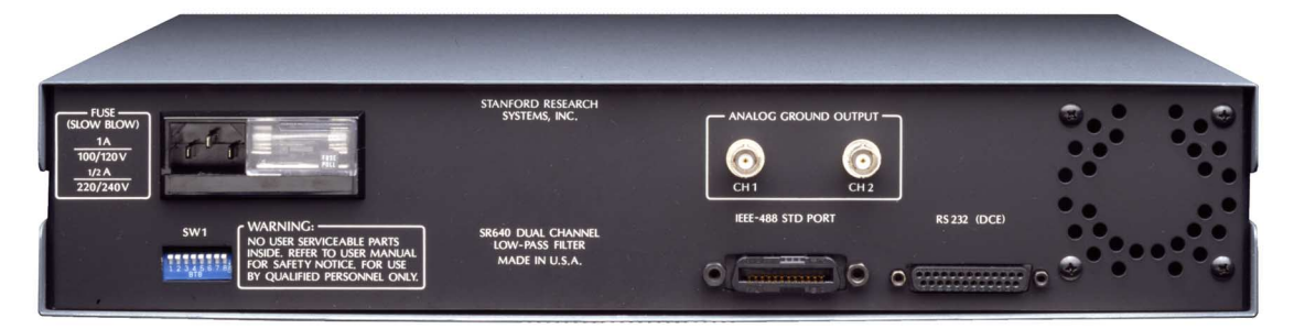
SR640 rear panel