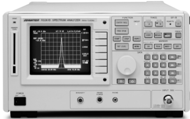
Used by NHK Japanese, Defense Agency