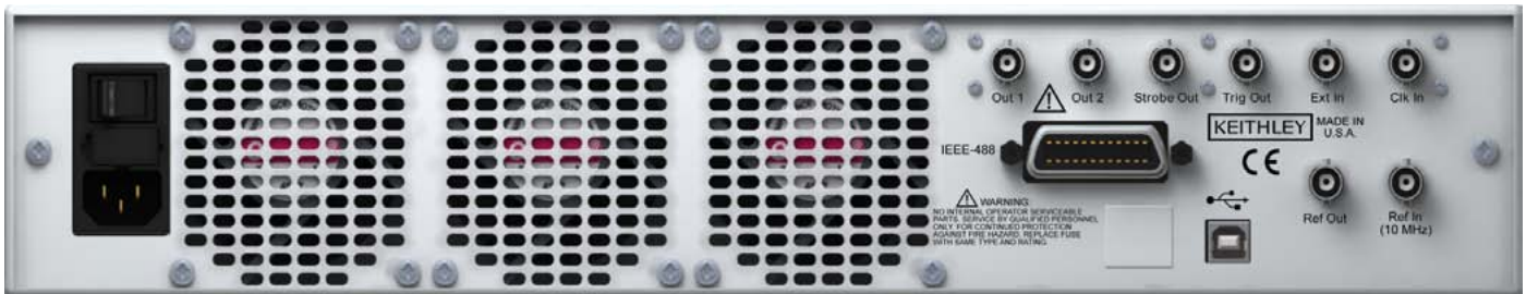
Figure 2. Model 3402-R, Dual-Channel with Rear Outputs