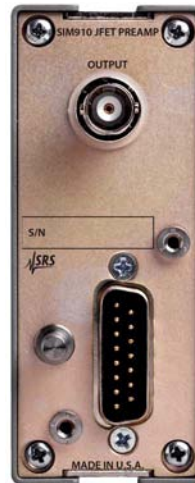
SIM910 rear panel