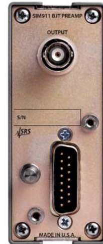
SIM911 rear panel