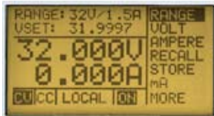
Normal display mode

Up to 20 system setups in each of the three supply ranges can be stored in the power supply's nonvolatile memory so that you can easily and quickly re-establish power supply settings for individual DUTs. This is a time-saving feature when you need to output multiple output voltage levels.