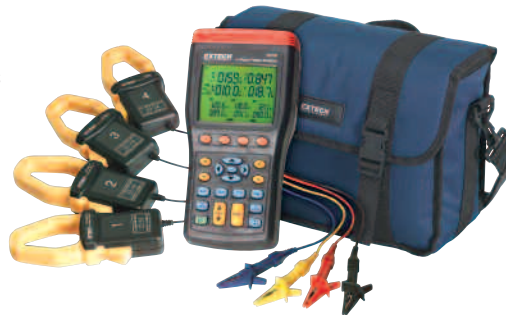
Includes 4 current clamps and 4 voltage leads with alligator clips