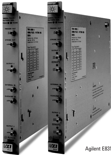
Agilent E8311A and E8312A