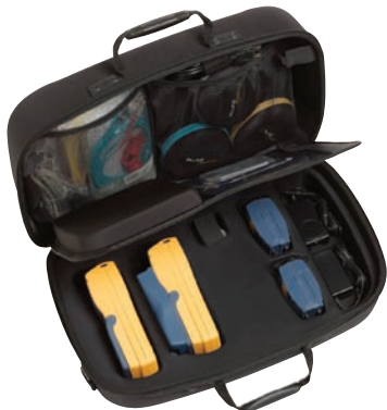
DTX Compact OTDR Kit