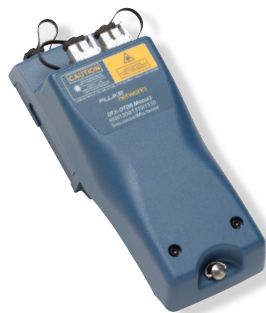
DTX Compact OTDR module