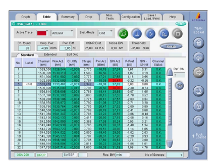
Graphical and tabular display showing pass/fail indicators and out-of-range values