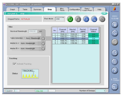
Channel drop/isolation function