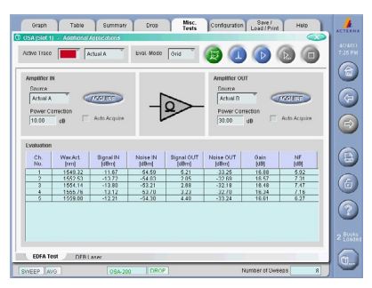
EDFA test application