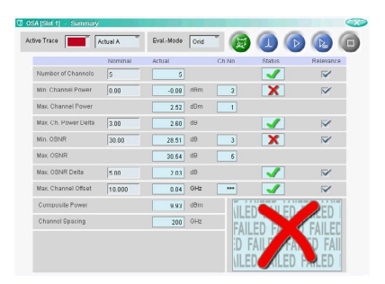
Tabular display showing summary failed