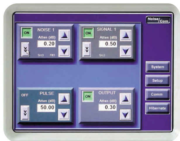
Intuitive standard control menu