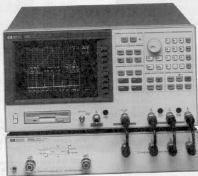
HP 4396A with HP 85046A