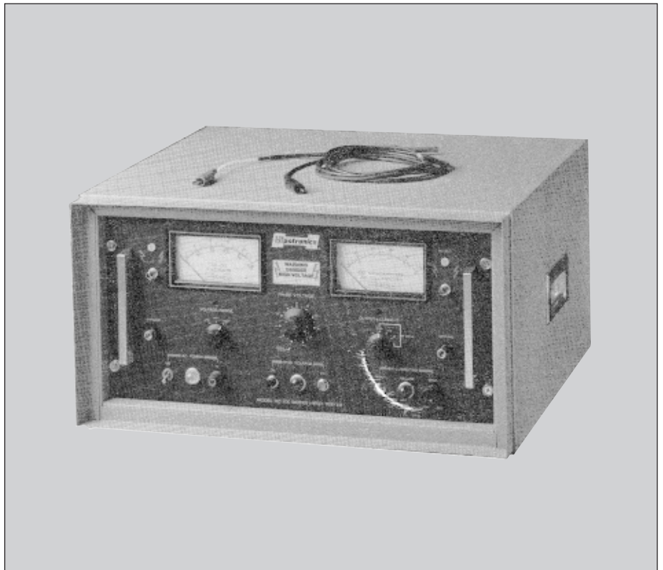
Model HD125 AC/DC Hipot Tester