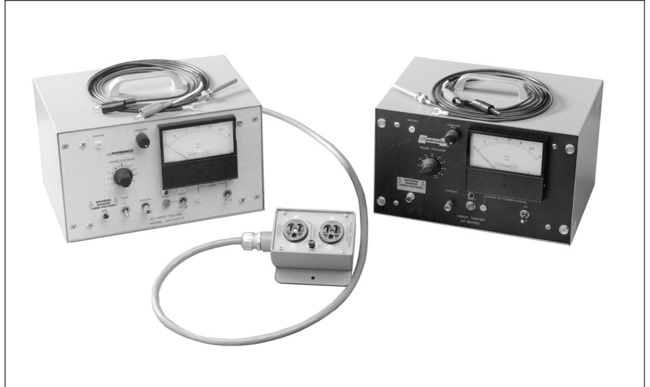
Model HA3AT and HA3AT-CT Hipot Testers