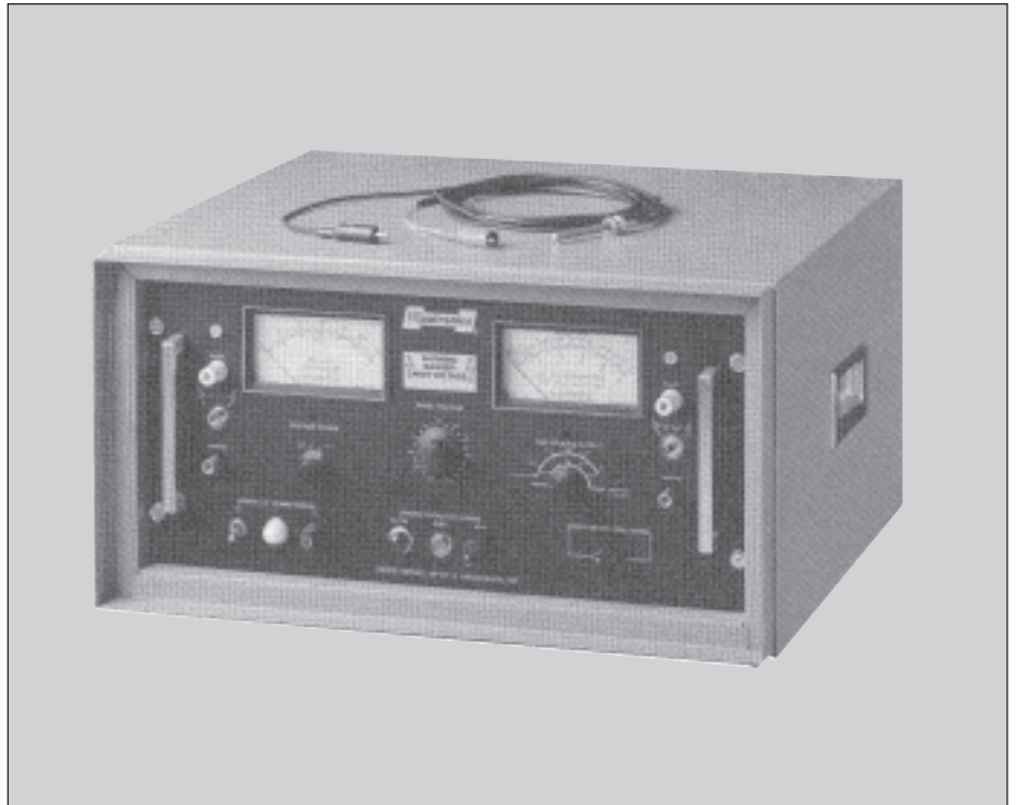
Model H306B Hipot Tester