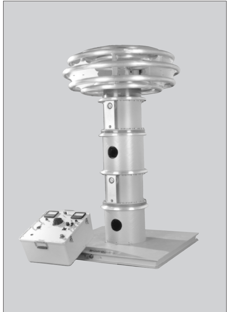
Model 8175PL-2 Modular DC Hipot