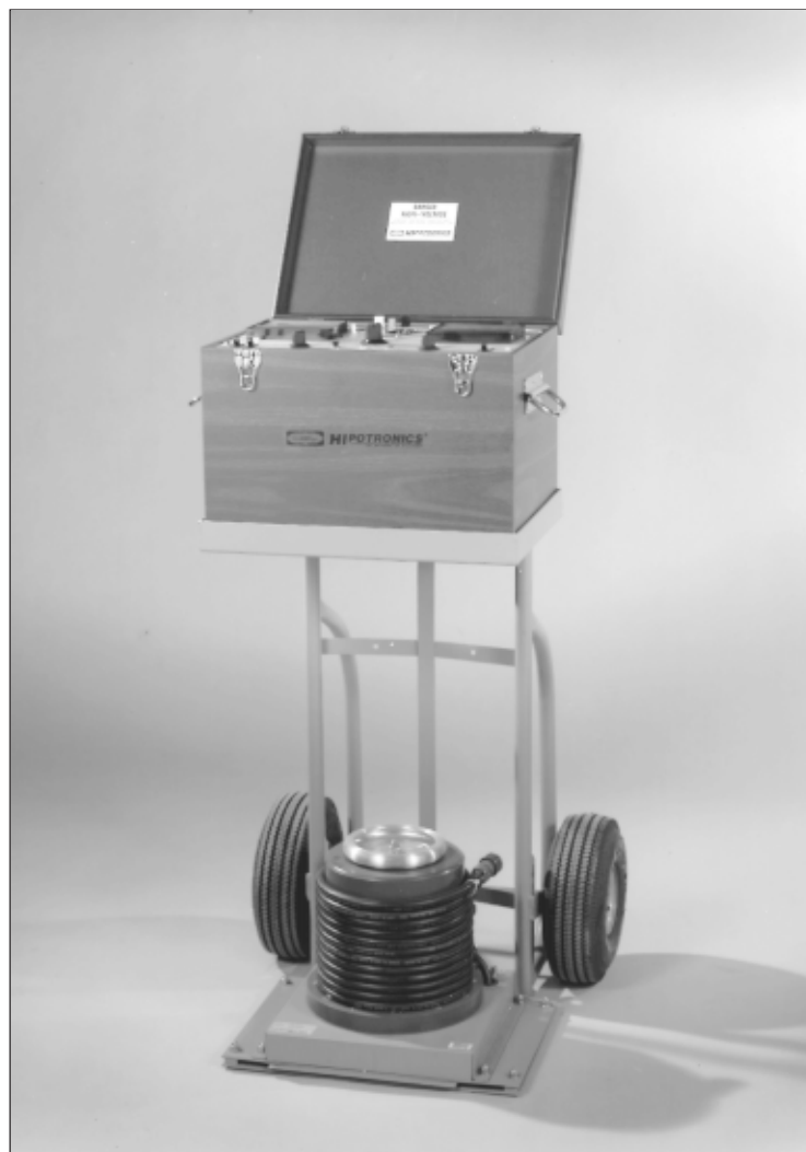
Model 30HVT Hipot Tester