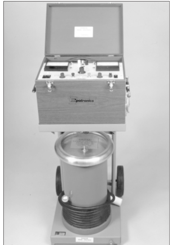
Model 100 HVT AC Hipot Tester

A triple range current meter enables low current readings of 0 to 1/10/100 mA on the 100 HVT. A triple range voltmeter is connected directly across the output for maximum accuracy. The 100 HVT has a 50 kV tap that is used for bucket liner testing and other low voltage, high current test requirements.