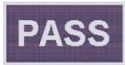
The test result screen can be set up to show a simple PASS/FAIL indication.