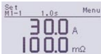
Clear test parameters can be displayed on a single screen

(Above display is shown at actual size.)